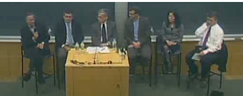
COP21 Climate Agreement—What Comes Next?