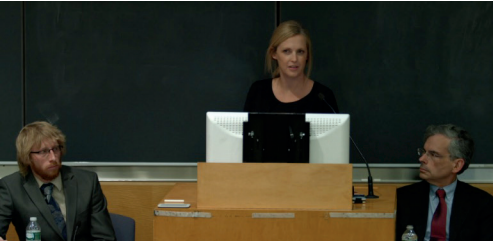
What Effect Will the Transpacific Partnership Have on Domestic and International Climate Change Action?