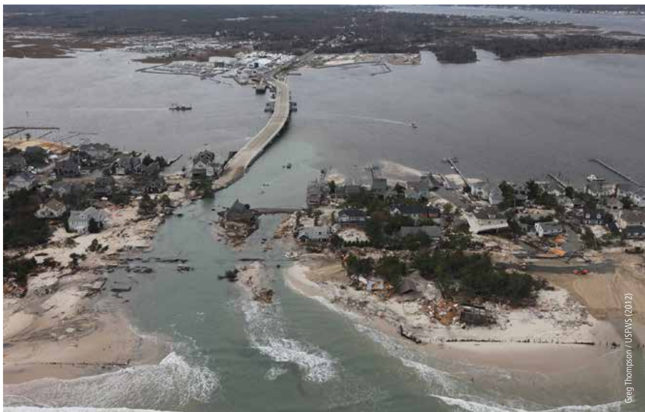
Greg Thompson / USFWS (2012)