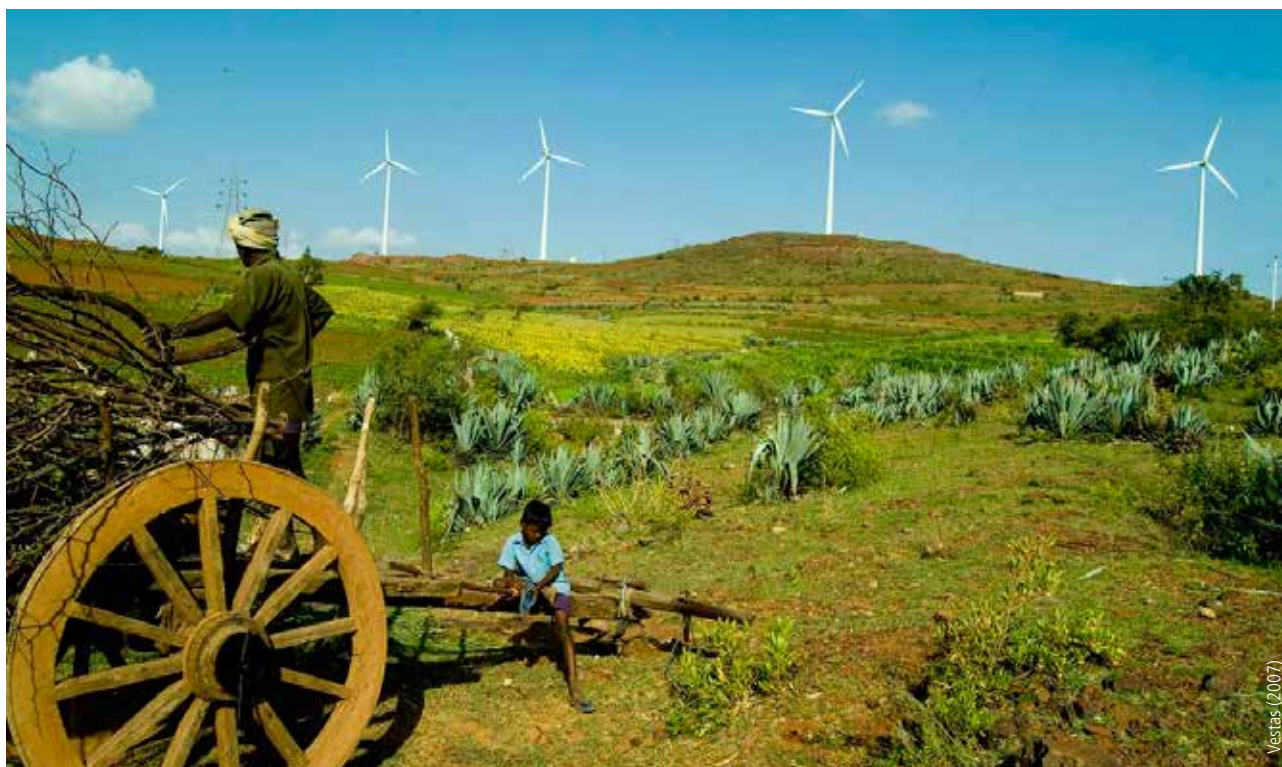
Wind turbines in rural India.

obligation to incorporate GHG mitigation goals into their development plans, laws, and policies. 160 This approach accords with fundamental principles of equity, responsibility, and burden sharing. 161