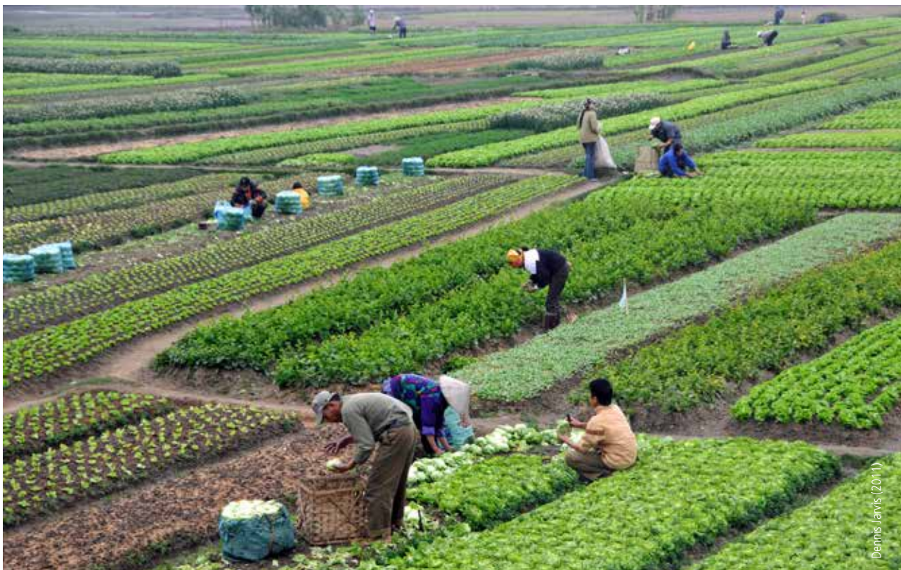
Changing precipitation patterns and higher temperatures can adversely affect food production in many parts of the world, such as Vietnam, where adaptation measures will be needed to protect food security and agricultural livelihoods.

extreme weather events, and the corresponding impacts on human health, water supply, ecosystems, natural resources, crops, and physical structures. Rural areas are also uniquely vulnerable to the effects of climate change due to: (i) a greater dependence on agriculture and natural resources, such as fisheries and forests; and (ii) existing vulnerabilities caused by poverty, lower levels of education, physical isolation, and neglect by policymakers. 33 Rural areas in developing countries face the most significant risks due to their geographical location (where climate change impacts are projected to be most severe), lack of adaptive capacity, and heavy reliance on agriculture and natural resources. 34