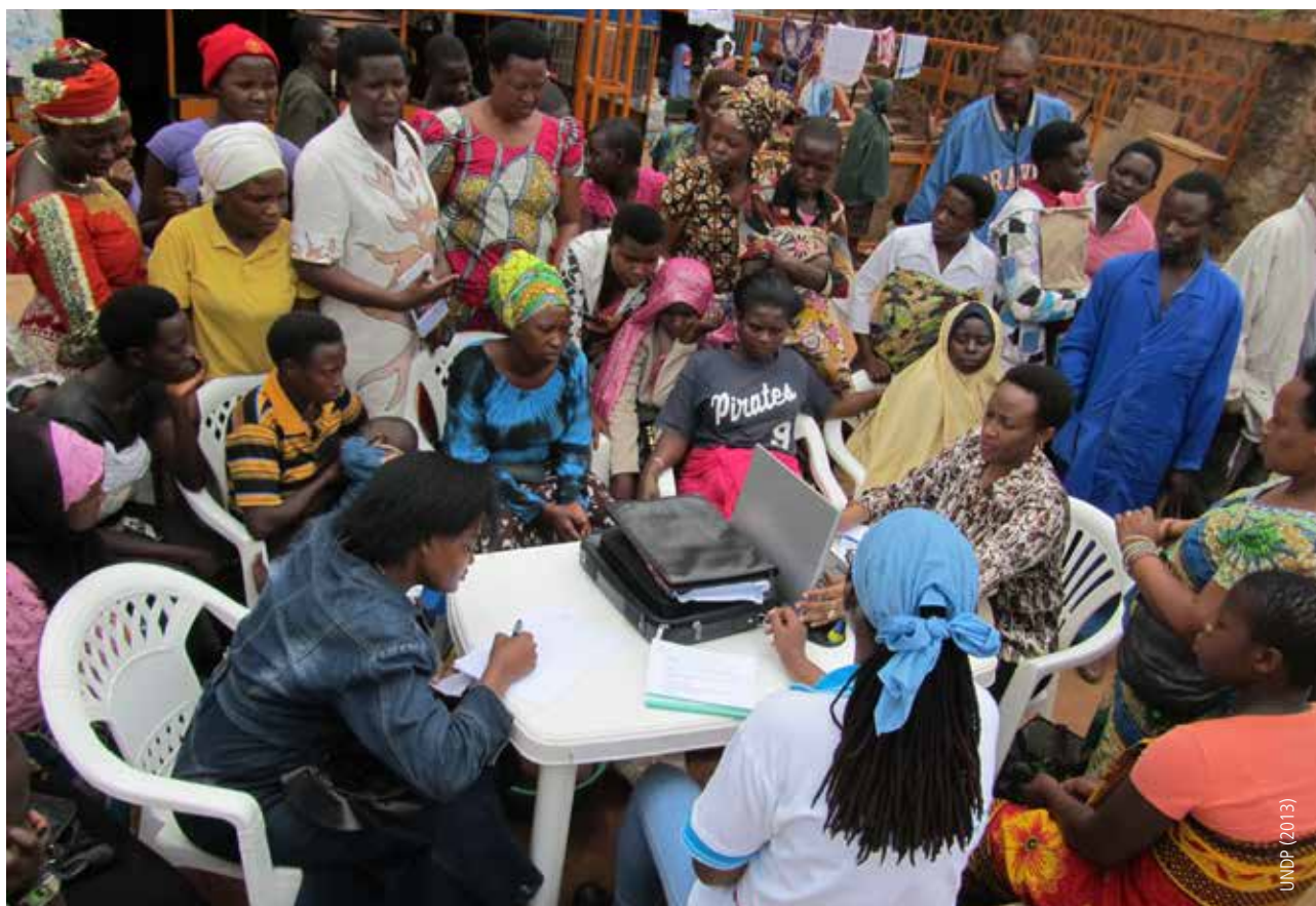
Open dialogue on the Post-2015 sustainable development agenda and local development priorities in Kigali, Rwanda

soliciting input from affected stakeholders, and actually incorporating the information and perspectives gathered through public consultation processes into final decisions. 250