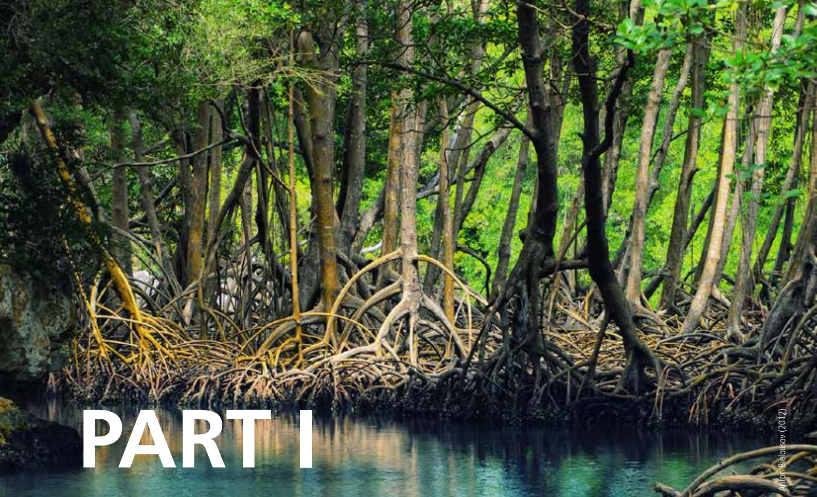
Anton Belousov (2012)