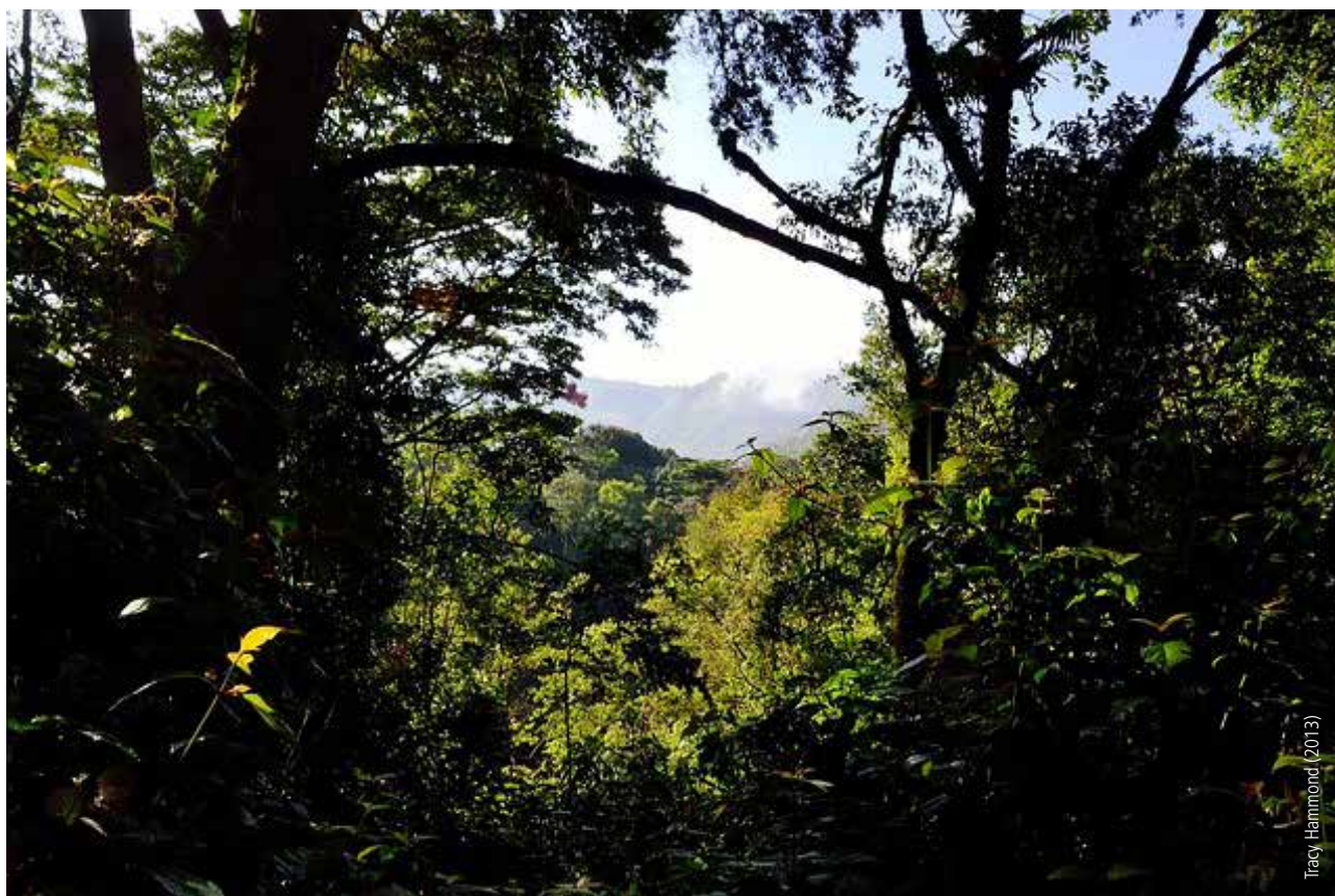
Bwindi Forest National Park, Uganda

The IFC standards appear to provide adequate protection for human rights—for example, they specify that, in the context of land acquisition projects, project proponents should “avoid/minimize displacement,” “avoid forced eviction,” and “improve or restore livelihoods and standards of living.” 275 They also require FPIC for indigenous peoples under specified circumstances. 276 These substantive provisions are complemented by the procedural mechanisms noted above.