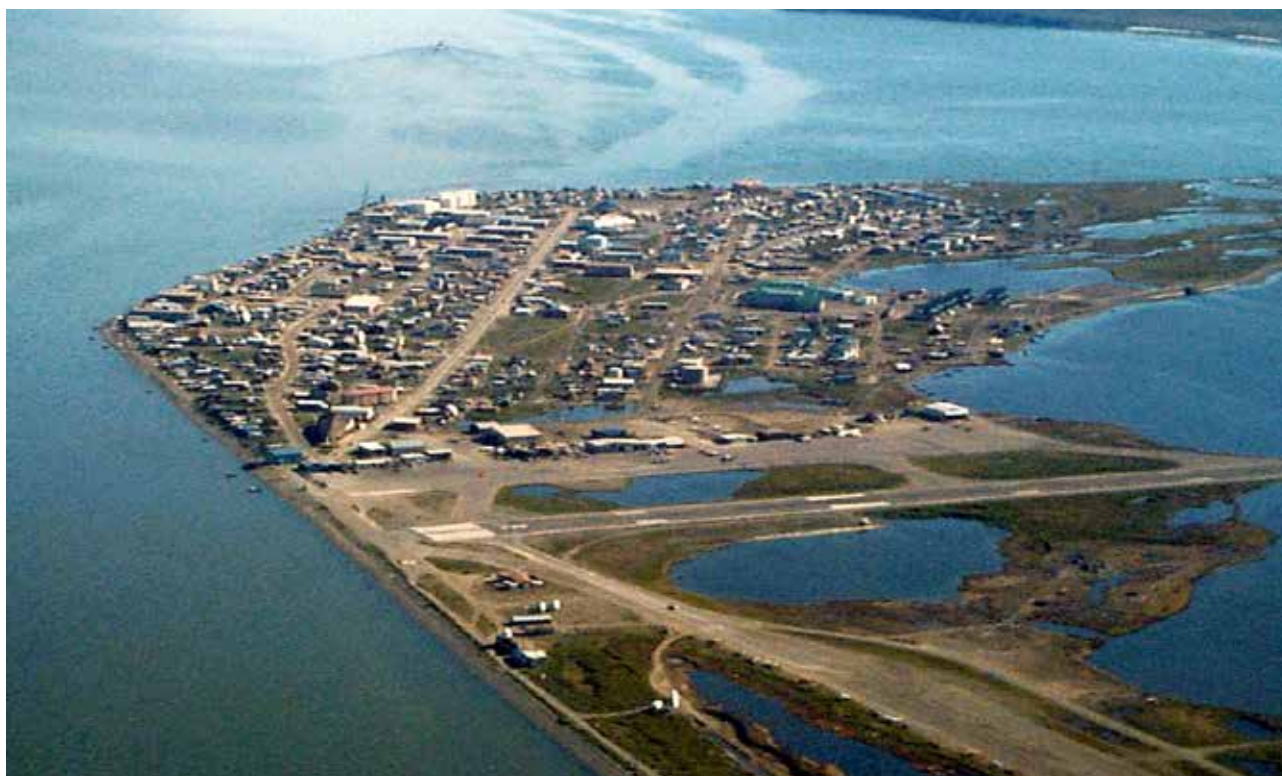
Aerial view of Kotzebue, Alaska, USA - an Inuit village facing the imminent prospect of displacement due to rising sea levels, melting permafrost, and erosion.

Affected rights: right to an adequate standard of living, right to health, right to life, right to food, right to water, right to property.