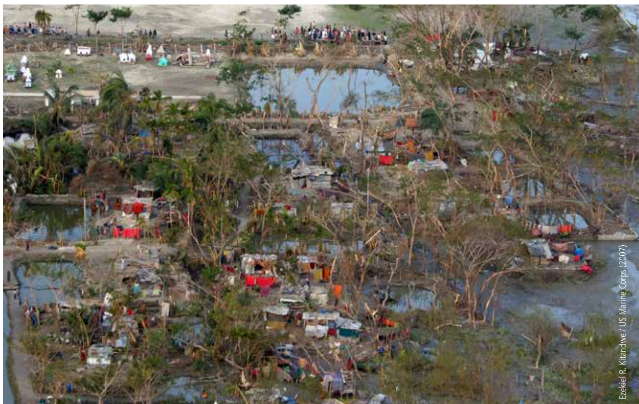
Damage to villages and infrastructure following Cyclone Sidr, which hit southern Bangladesh in November 2007

particularly in Africa, affected by drought and desertification, as well as floods.” 128 In addition, it calls upon developed countries to provide assistance to developing countries to address the adverse effects of climate change in those countries. 129 These directives complement the human rights obligations noted above.